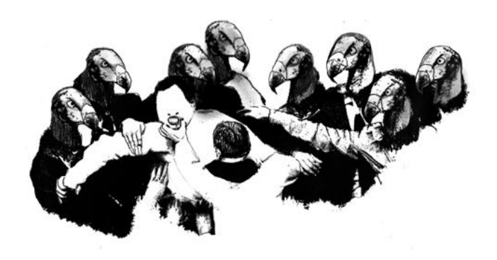
Assemblée générale des actionnaires